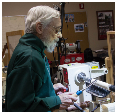
Testing for flat spots