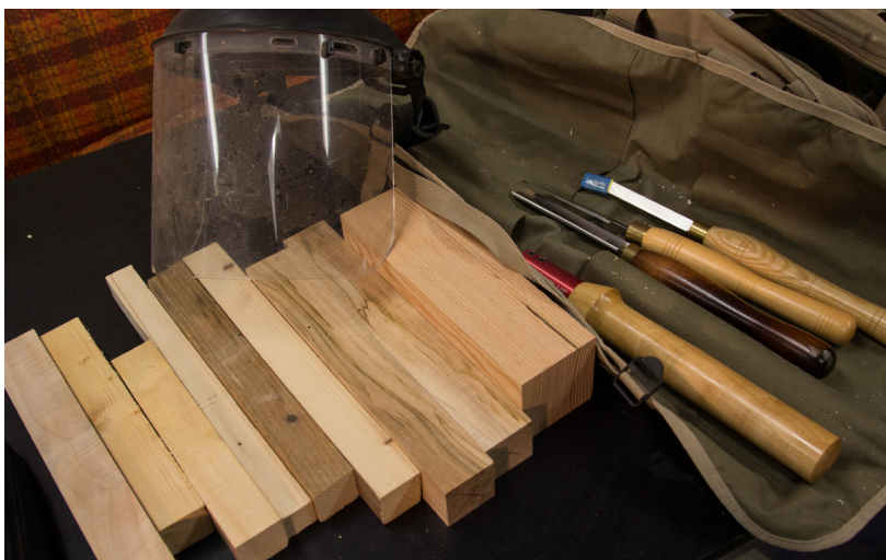
Materials for the demo