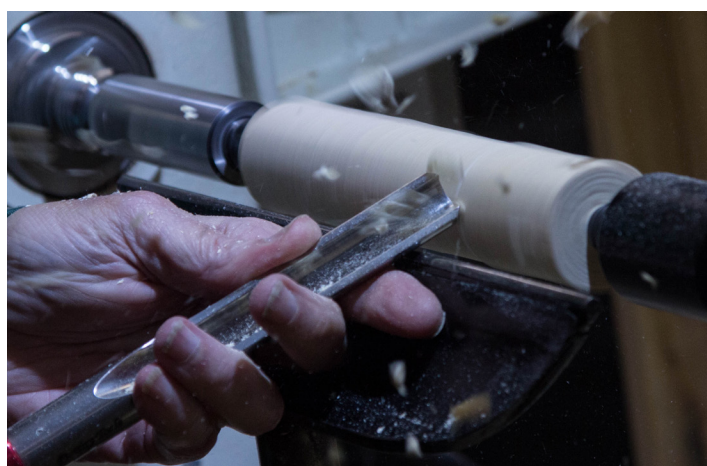
Smoothing the cylinder