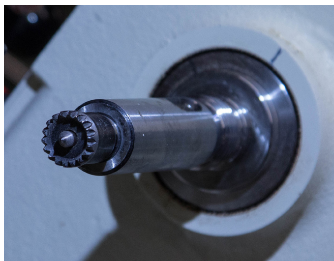
Extended drive center