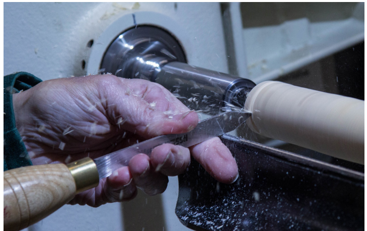
(Above) Parting tool cut (Below) Tapered parting tool