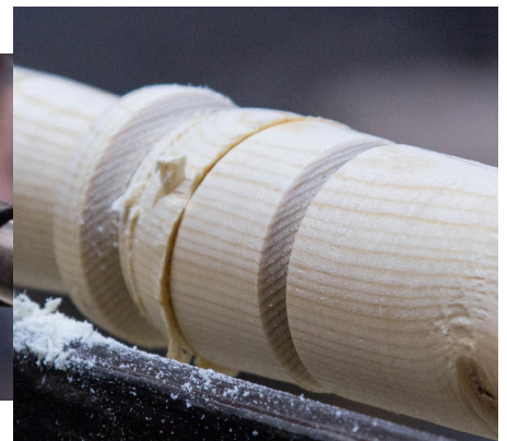
A classic 'catch'