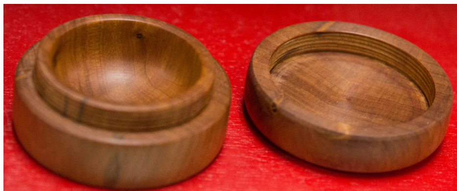
. . . his hand-chased threaded box.