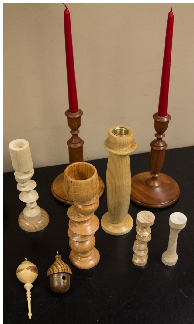
Some of the newest entries into the President's Challenge