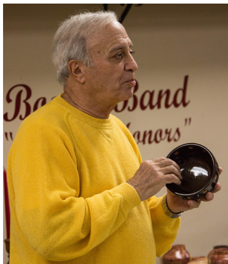
Ed Cohen's Walnut bowl