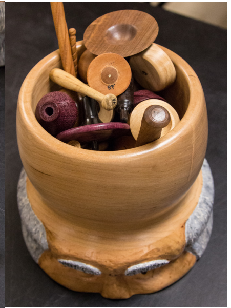
Inside the Mind of a Woodturner