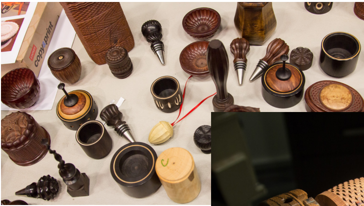
Assorted Ornamental Turnings