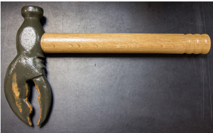
Lobster Claw Hammer