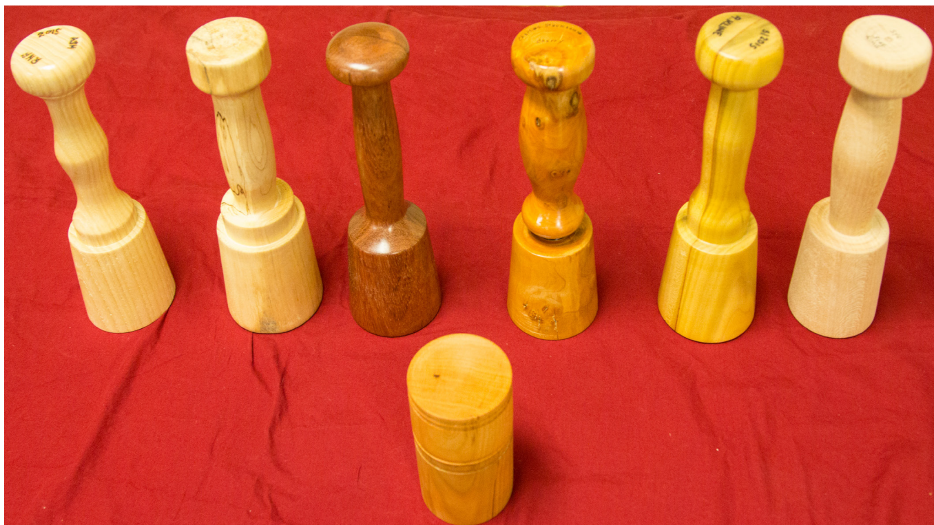
Uniform carver's mallets and a box were entered in June.