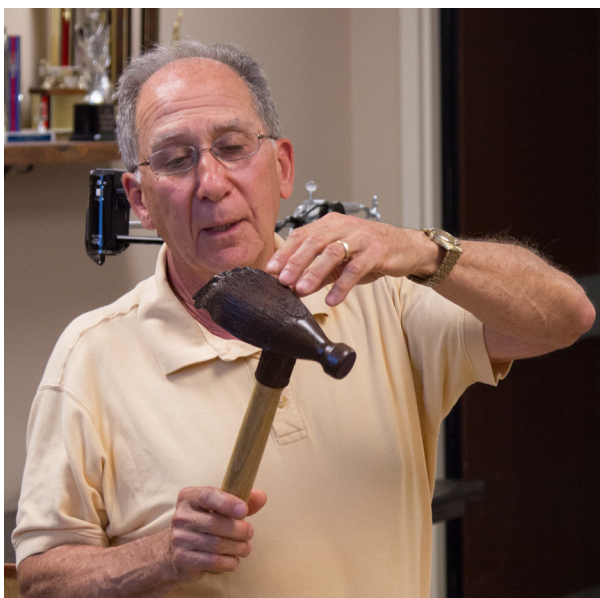
(Counter-clockwise from above) Holding the Bear Claw Hammer; other Claw Hammers; the Great White Wrench closeups and slide.