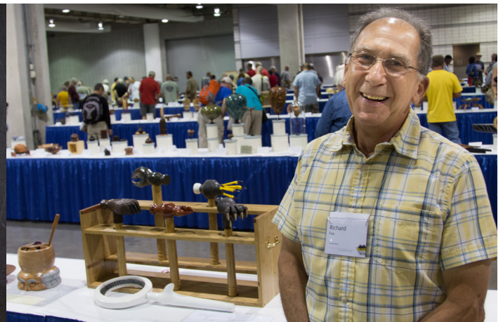
Displaying at Symposium