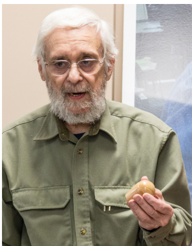
Louis Harris' Oak box