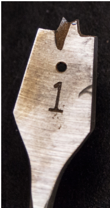
Tapered double pointed spade bit