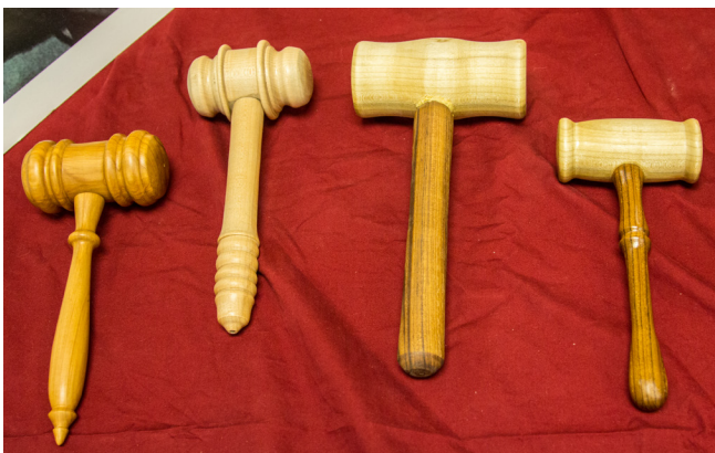
The group of gavels