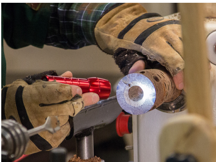
Showing the drilled depth