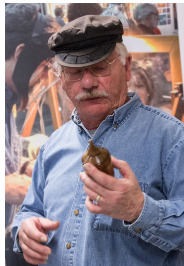
Ernie Grimm's Sapele Box