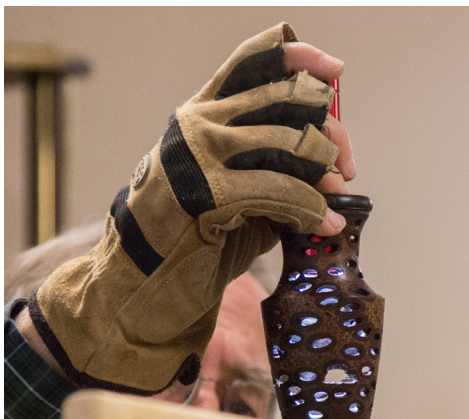
Light shines through a hollowed pod