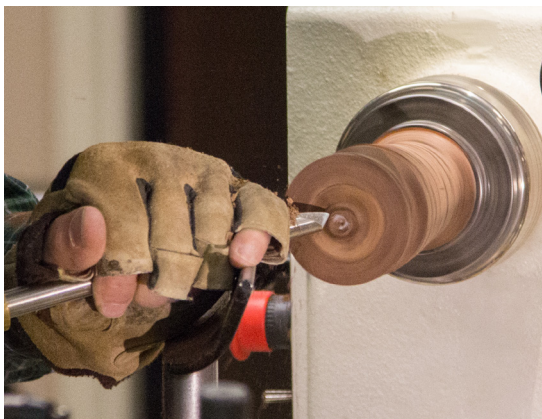
Turning a center dimple