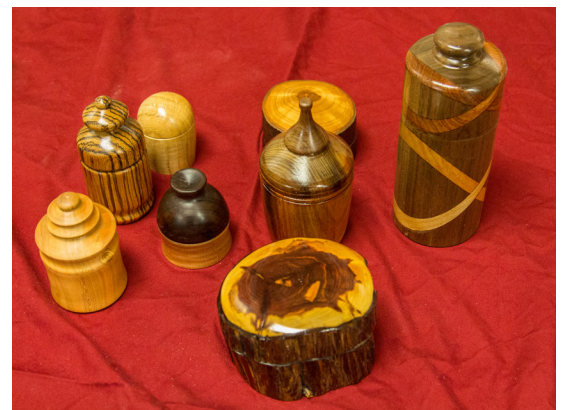
The bunch of boxes