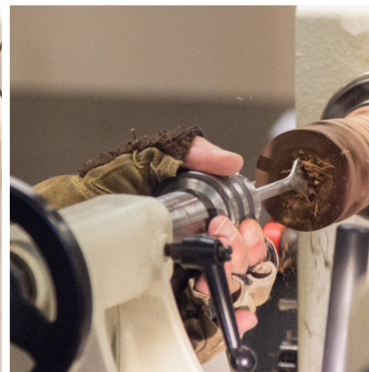
Drilling with tapered spade bit