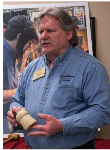
Clark Bixler's Willow box