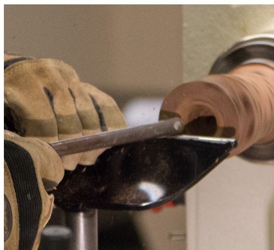
Hollowing with a spindle gouge