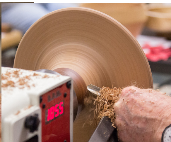
Working down to bottom.