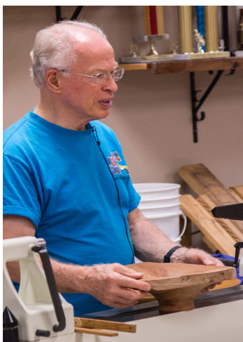
The warped rough bowl