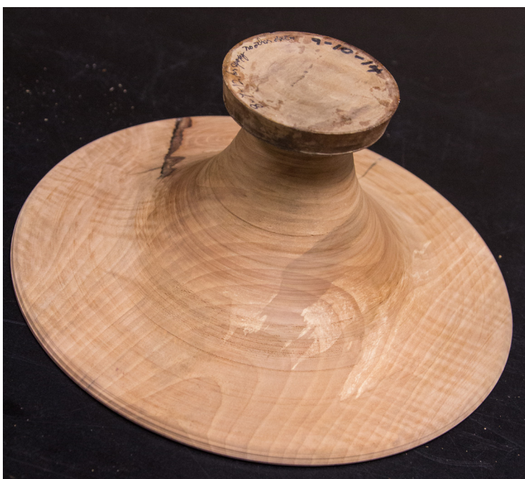
Ready for sanding