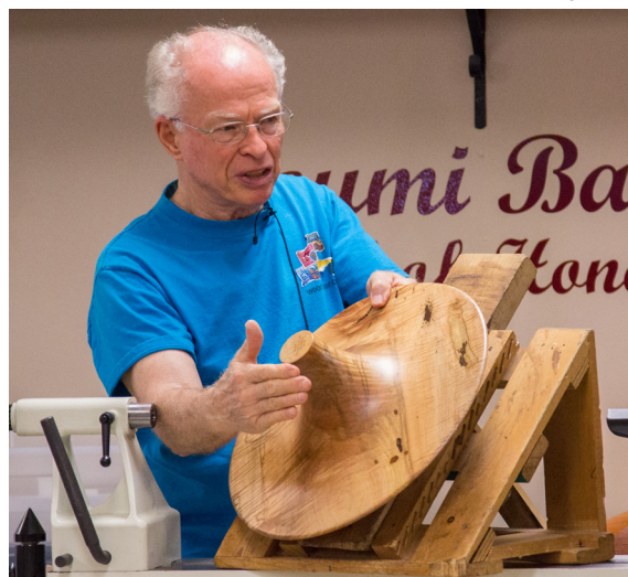
Tilting bandsaw sled ( left ); how blank is mounted ( right )