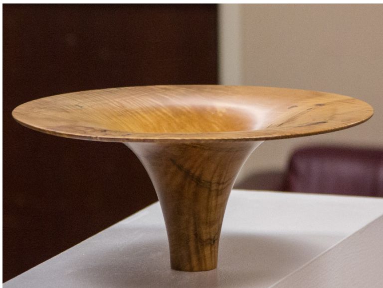
Mmm. Luscious curves, wafer thin.