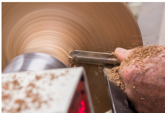
Getting the base svelte