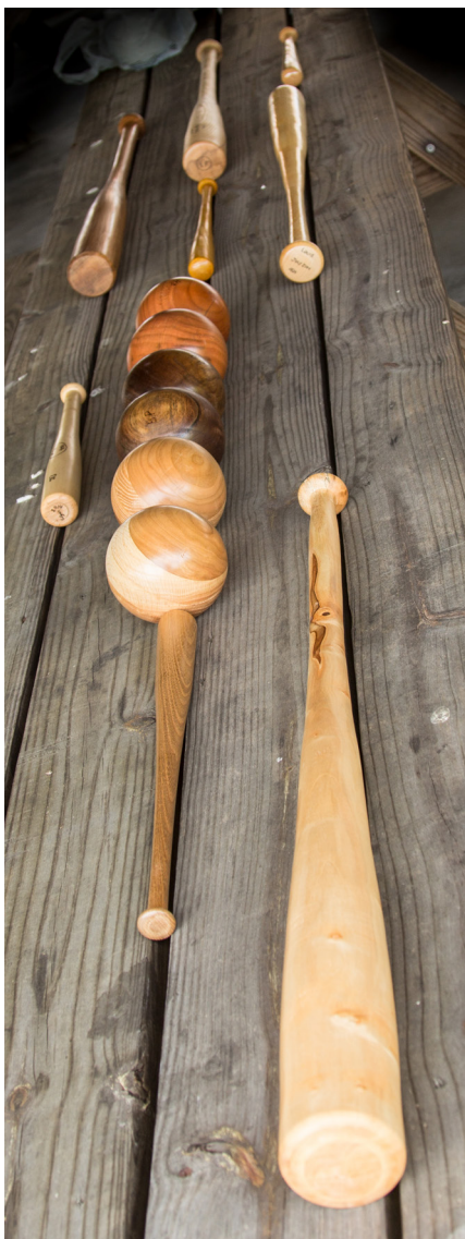
Lined up with old and new Bocce balls.