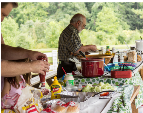
BAT members dig in to feast