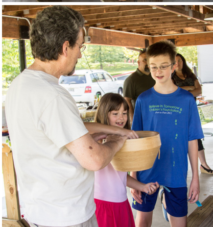
Above left and right - the raffle layout.