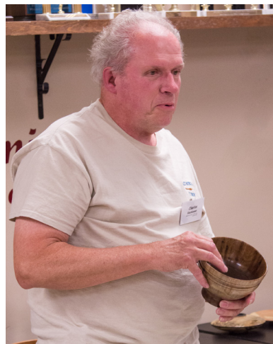
Charles Stackhouse's Walnut bowl