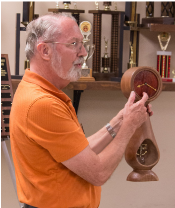
Don Keefer's Sapele pendulum clock