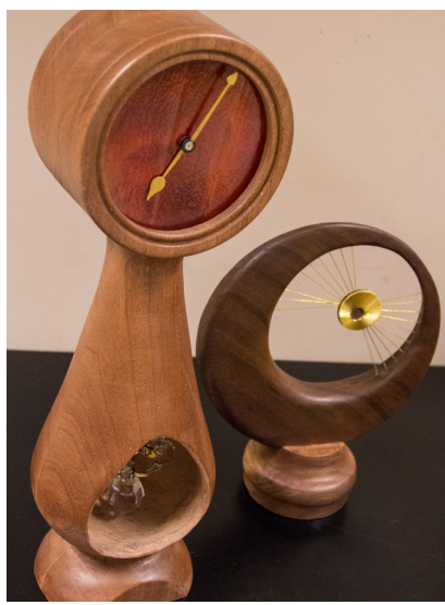
Don Keefer's Sapele Clock and African Mahog- any sculpture