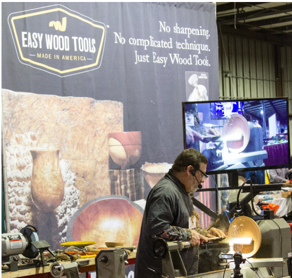
Easy Wood Tools demonstrated.