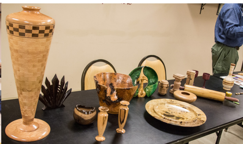
The collection of show and tell items