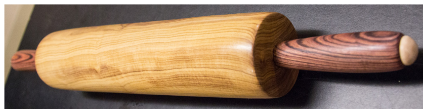
Jim Oliver's heavy Olive and Kingwood rolling pin.