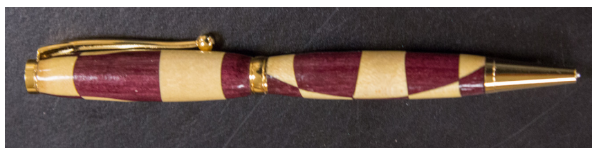
Laurie Kellum's segmented pen