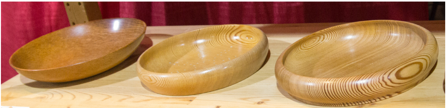
Visitors were bowled over by BAT's display.