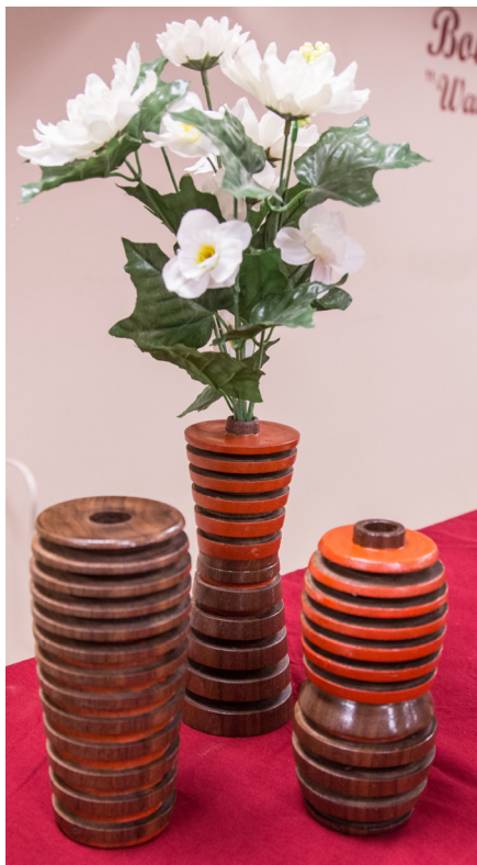
Don Keefer's Walnut Vases