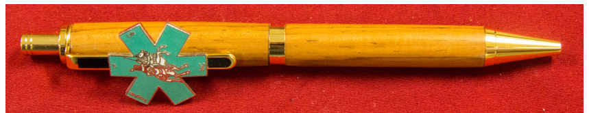
(Above and below) Jim Conlon's pen with pin and Lignum bowl