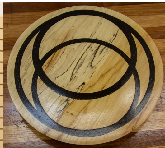
Jim Oliver - Inlaid platter