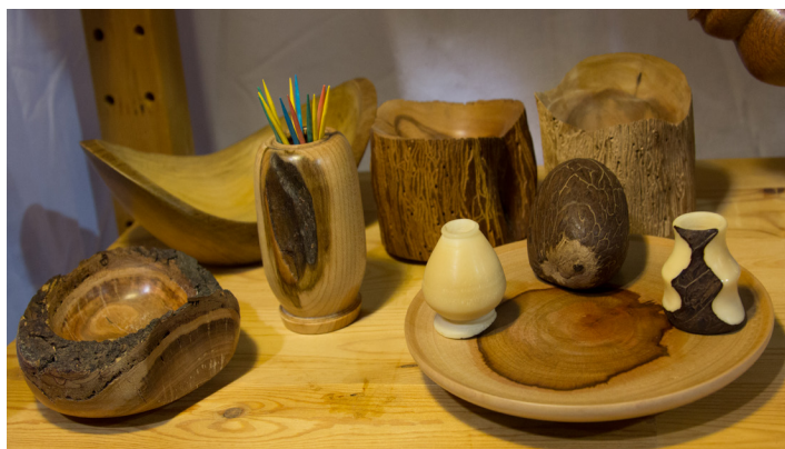
A few of the displayed items