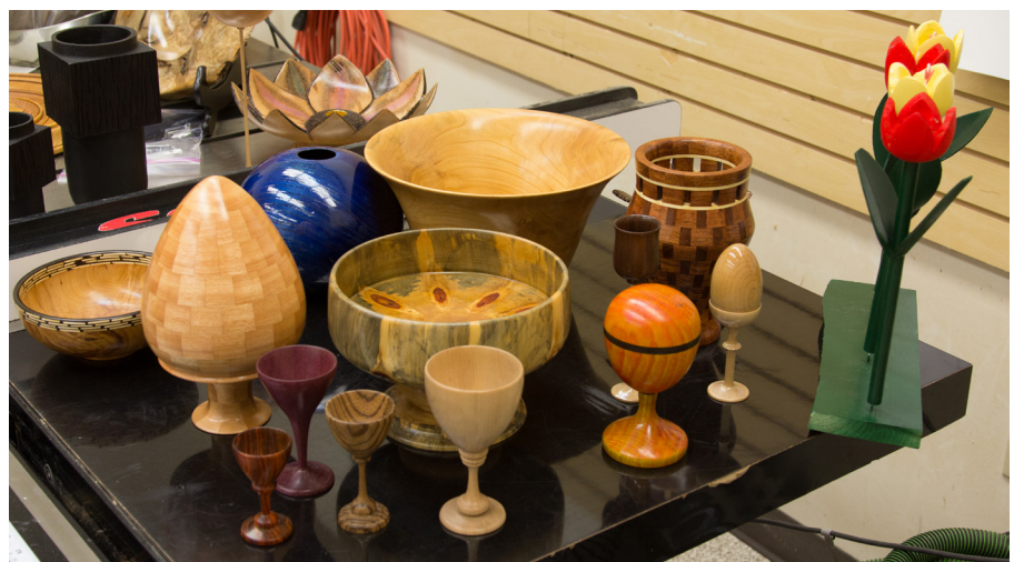
June - Excellent Show and Tell and President's Goblet Challenge