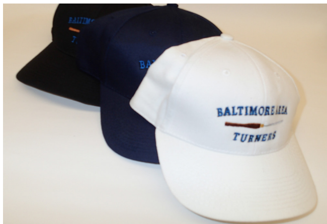
BAT Brand Wear - It's the tops.