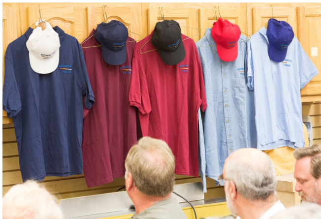
BAT Brand Wear - it's turning heads.