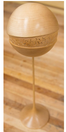
David Smith's pierced hollow sphere

Zoom in on these photos to see the exquisite detail.