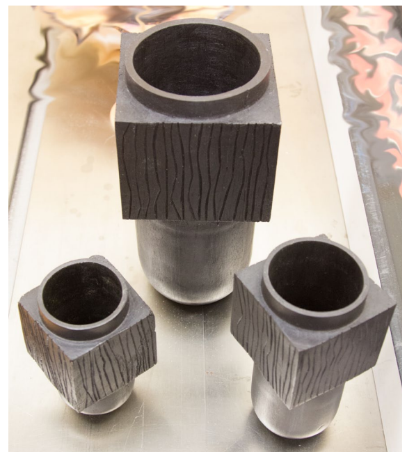
Yaakov Bar Am's sculptured square hollow forms