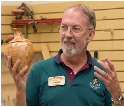
Don's segmented Lyptus amphora