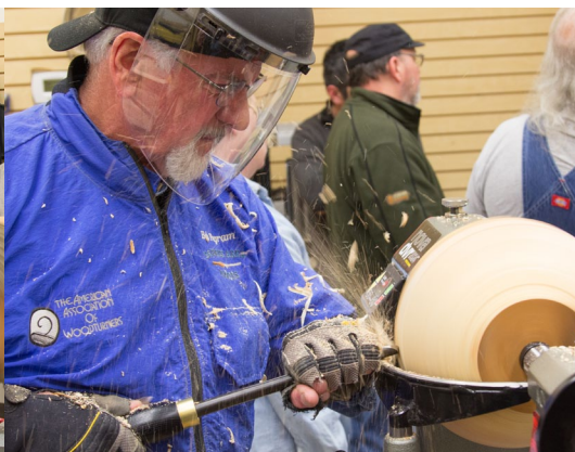
Roughing the exterior.