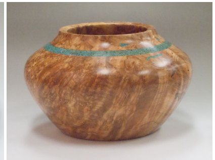
Bob Pegram: "Southwestern"; Inlaid Maple