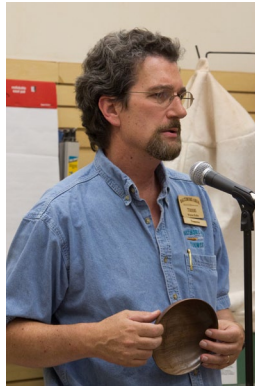
Wayne Kuhn - Walnut bowl