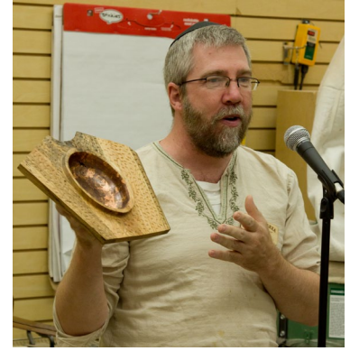
Yaakov Bar Am - gilded winged crotch bowl