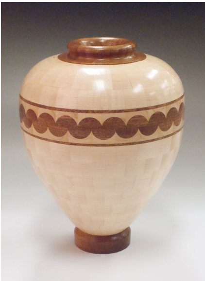
Dave Maidt: Segmented Wave Form: Maple and Sapelle