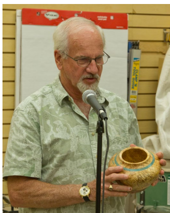
Bob Pegram - inlaid southwestern bowl