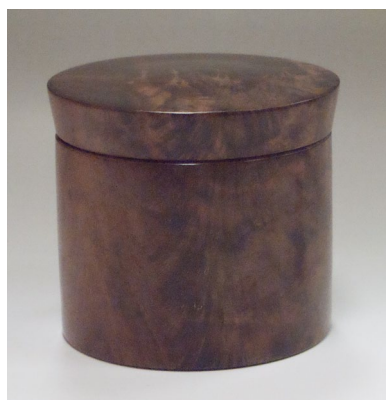
Bob Rupp: Walnut Box