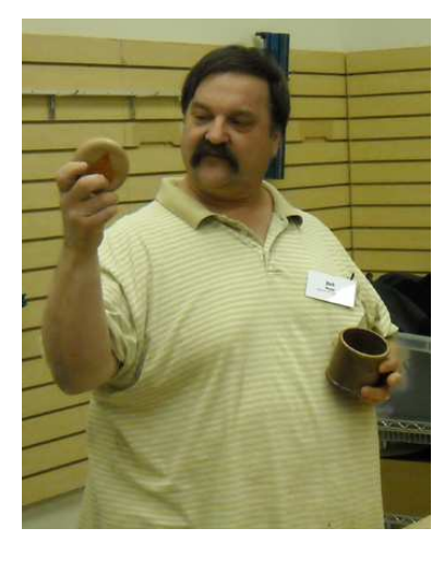
Bob Rupp-Sycamore Box with Bloodwood heart