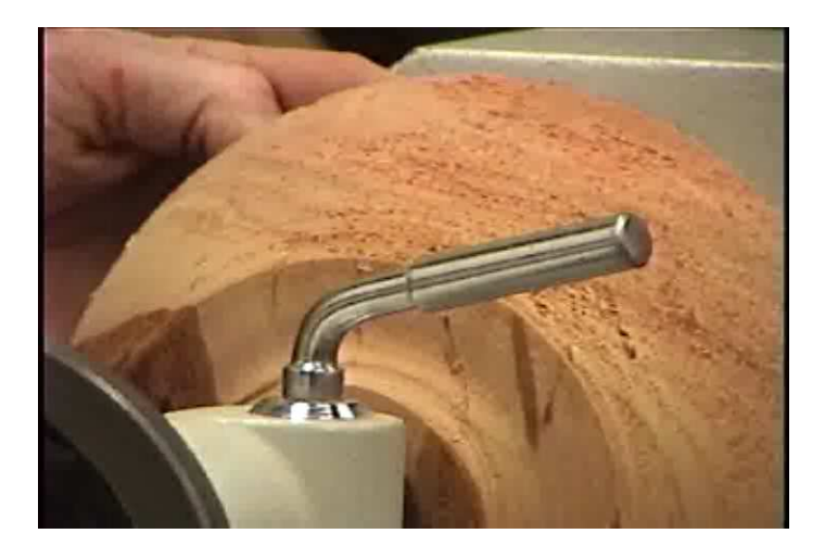
Keith then showed us a finish we are all too familiar with.