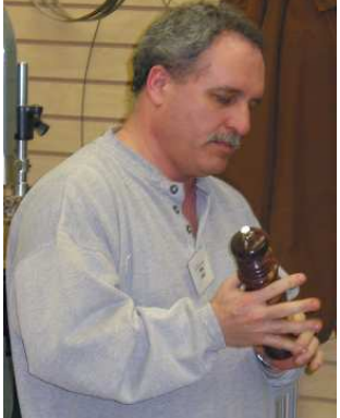
pepper mill techniques.