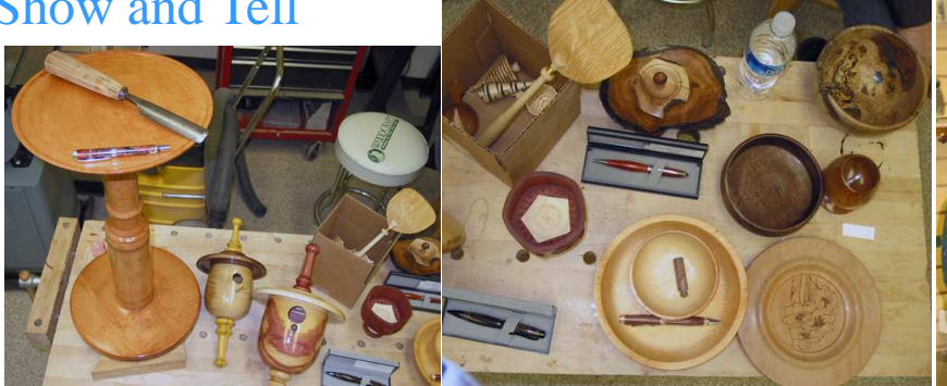
Some of the many items shown and told about at the March meeting.