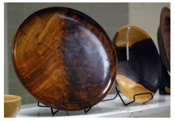
Walnut crotch platter

Among several dozen other displays at Loch Raven High School was the BAT Craft Show. Artfully displayed were turned creations of eight of our members. A variety of items from pens to bottle stoppers, and Christmas ornaments to bowls and hollow forms were on display. Most of the turners were on hand to discuss their items to the many interested visitors. A few items were sold as well.