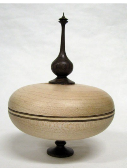
Presidential Challenges - 2017