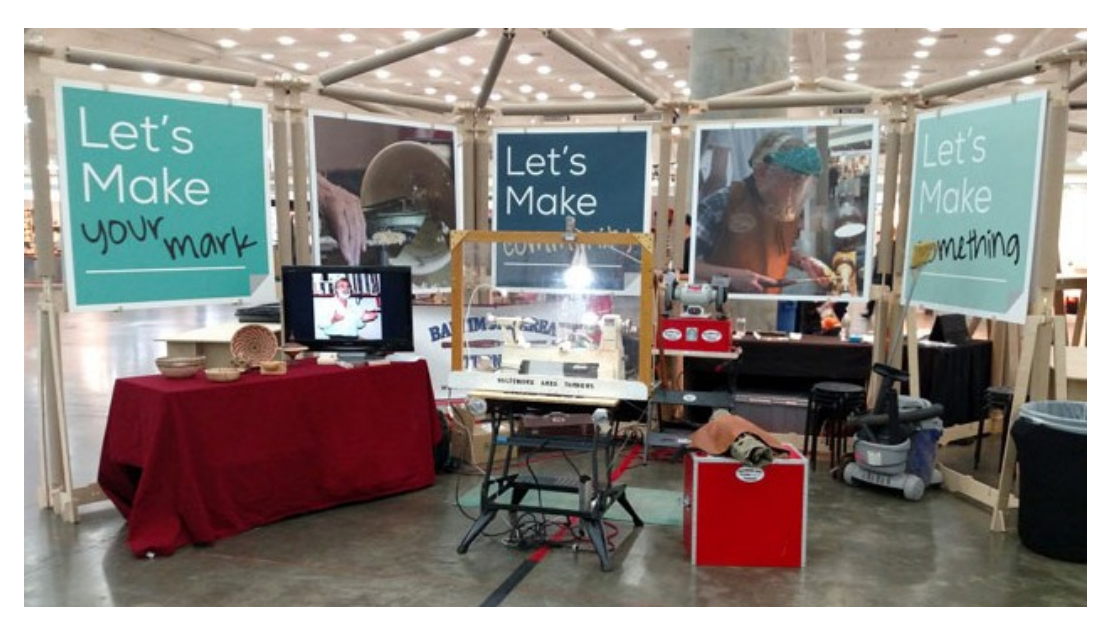
The BAT booth at the ACC Show at the Baltimore Convention Center.

For the sixth year in a row, the Baltimore Area Turners were invited to demonstrate the process of woodturning at the American Craft Council show at the Baltimore Convention Center. The ACC show is a premier art and craft show held every year in multiple cities across the nation. The show is an enormous display of works of top-drawer artists in textiles, glass, jewelry, wood art, furniture, textiles and more.