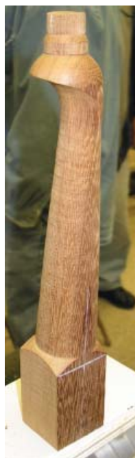
Turned Padfoot Leg