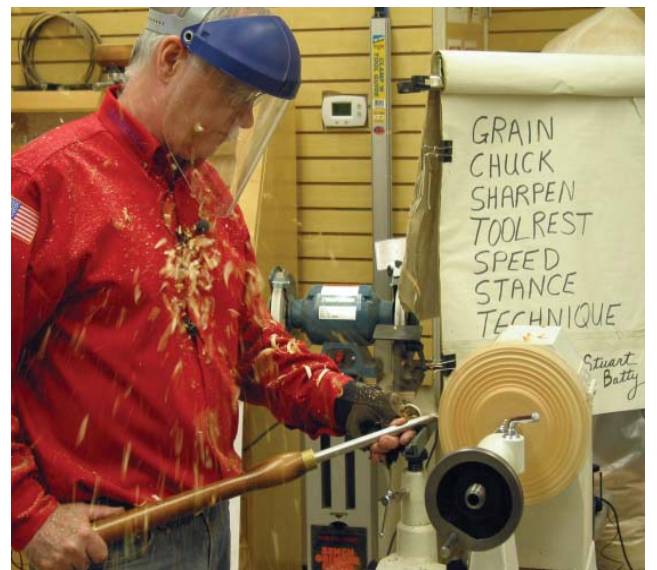
Check out that Stance!