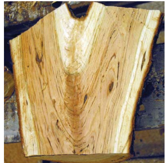
The Exposed Crotch