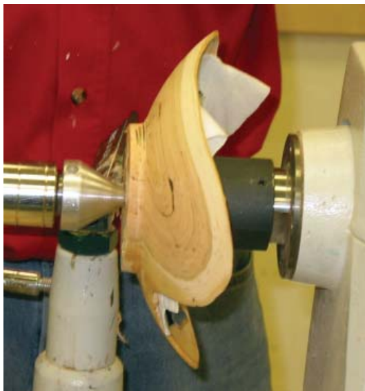
Reverse Chucking to finish bottom