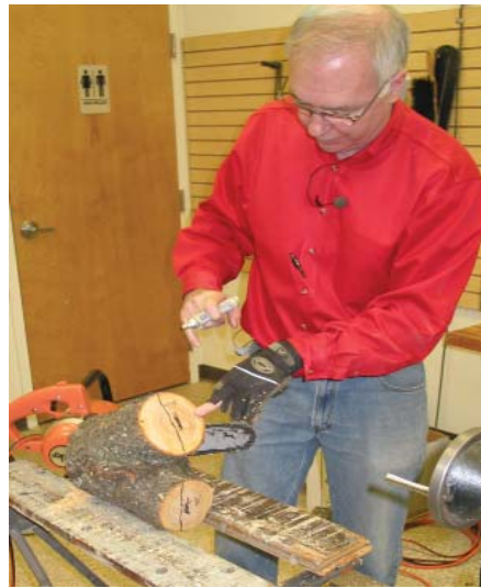
Marking out centers