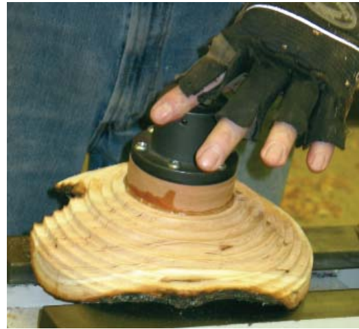
Gluing to Faceplate

Many folks had signed up for Lyle's demo and classes. Only 7 people showed up. All of us agreed that this was a fantastic demo but BAT ended up footing a large bill for Lyle's services.