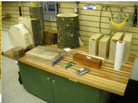
Numerous items up for the raffle.