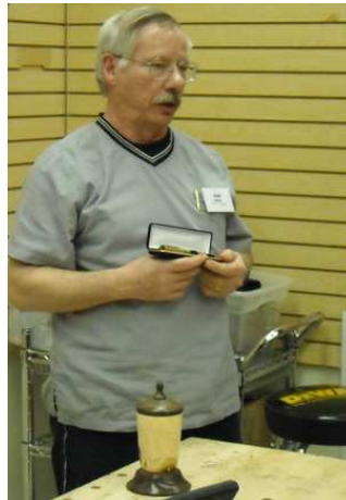
Ernie Grim-American Chestnut pen