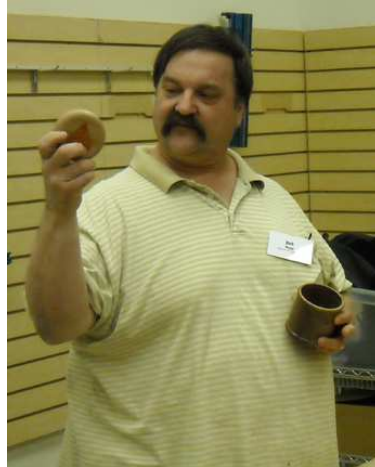
Bob Rupp-Sycamore Box with Bloodwood heart