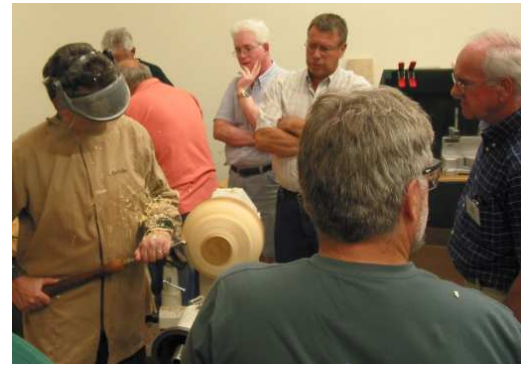
. . . as BAT watches