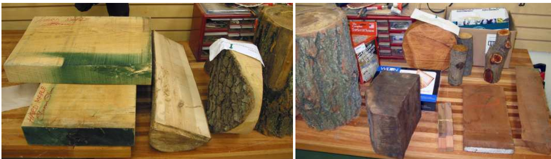
A wide variety of species in slabs, logs, and blanks in the September raffle.

A veritable cornucopia of wood: blocks of Hard Maple, Cherry rounds, primo Ambrosia Maple, Pear and Locust logs, Hickory, spalted Maple, Yew, Cherry spindles, Rosewood pen blanks, and Spanish Cedar boards. Woodcraft donated Wilton Mini 5-piece Lathe Tool set and TopSaver Rust Remover and Lubricant System. Thanks!