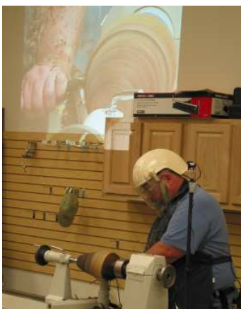
Thanks to video, everyone gets a good view.