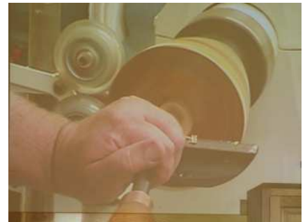
Video view of hollowing.