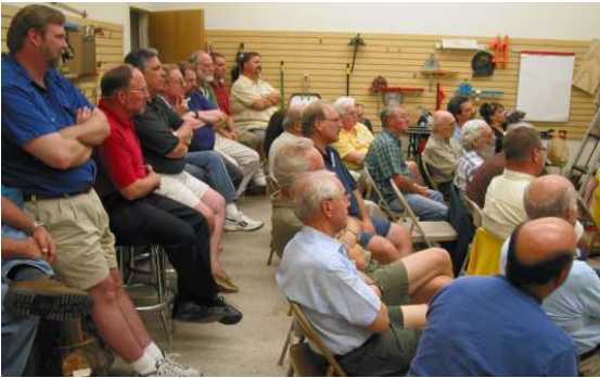
BAT watches as . . .