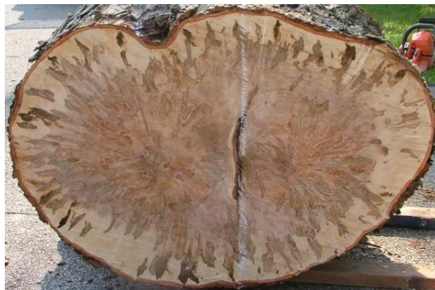
Check out that figure !