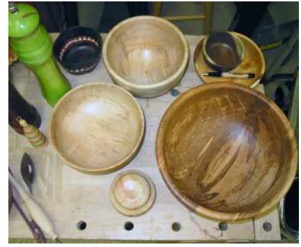
Some of the many items presented and discussed at the July meeting.