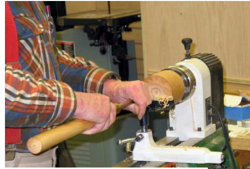
Nice shavings cutting end grain.