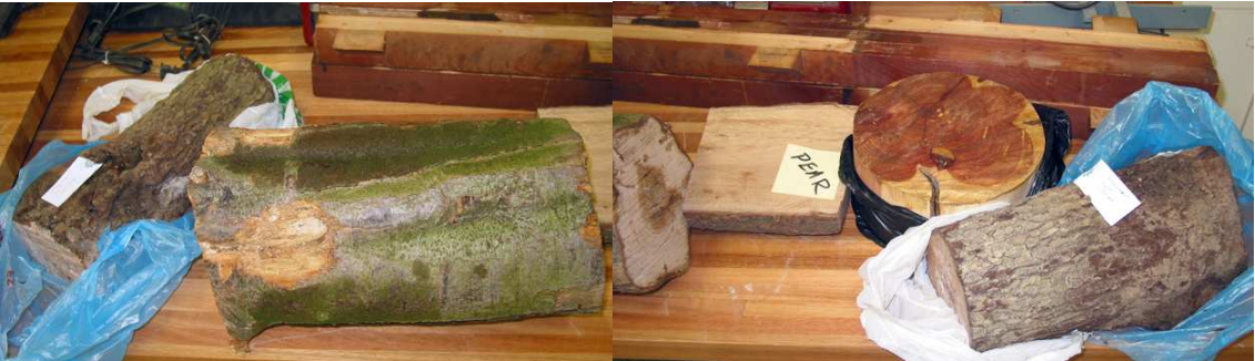
Logs, expansion slides and slabs in the February raffle.

Apple and dogwood logs, Red cedar and walnut slabs, dining room table expansion slides, and an adjustable bowl gouge sharpening jig were raffled.