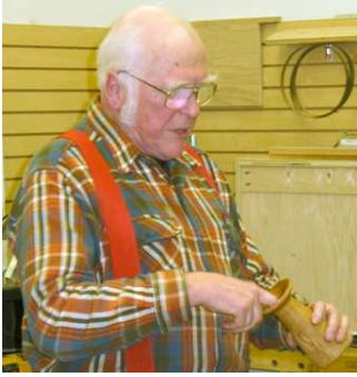
Court explains hollowing end grain.