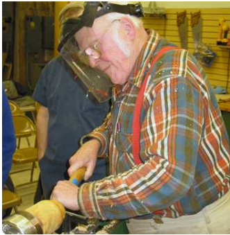
Court makes it look easy.