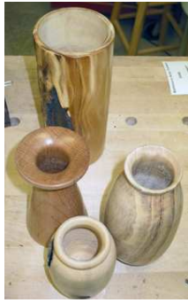
Hollow forms made with the Termite.