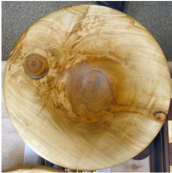
Maple Bowl with Turquoise Inlay