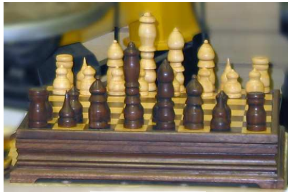
Turned Chess Set