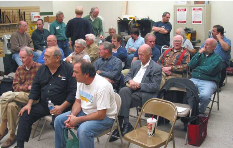
Attendees of the November meeting re-elected all 2007 officers to continue to serve in 2008.