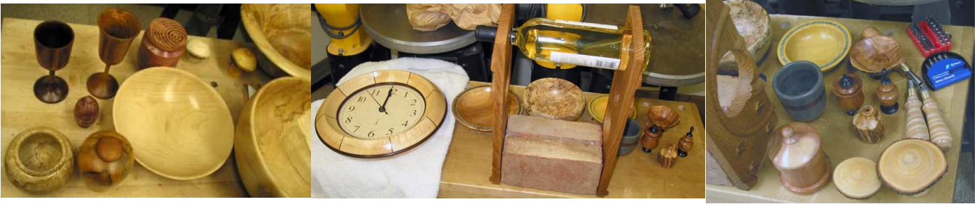
BAT members have been busy as beavers turning a plethora of items using a wide variety of techniques.