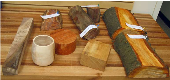
A portion of the November Raffle cache.