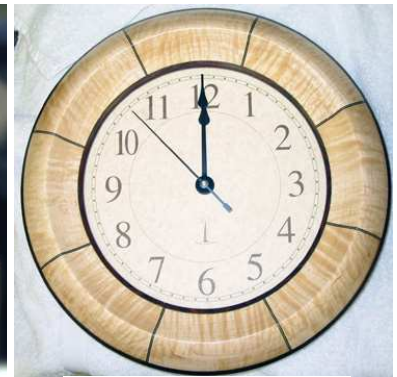
Segmented Clock Ring